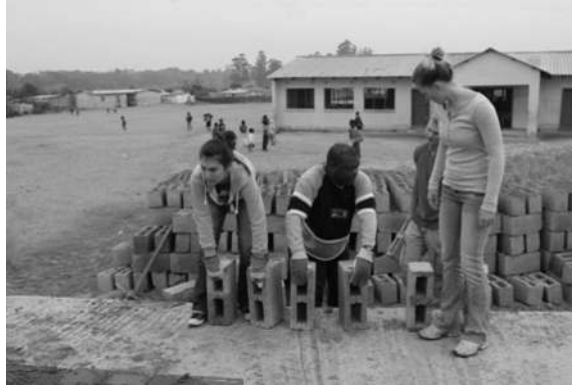
Moving Bricks Closer to the Foundations

Our aim is to help build a school so that children in this town can get an education. Not going to school affects the whole of their lives. And it affects the whole world too.